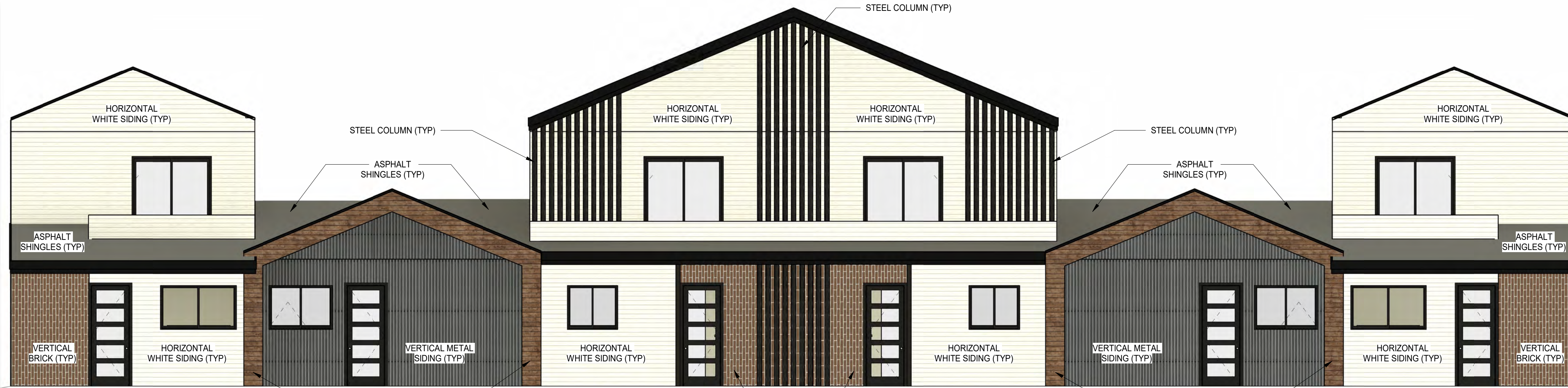
2 SOUTH ELEVATION A4.1 3/16" = 1'-0" (RE: 17.A0.1)