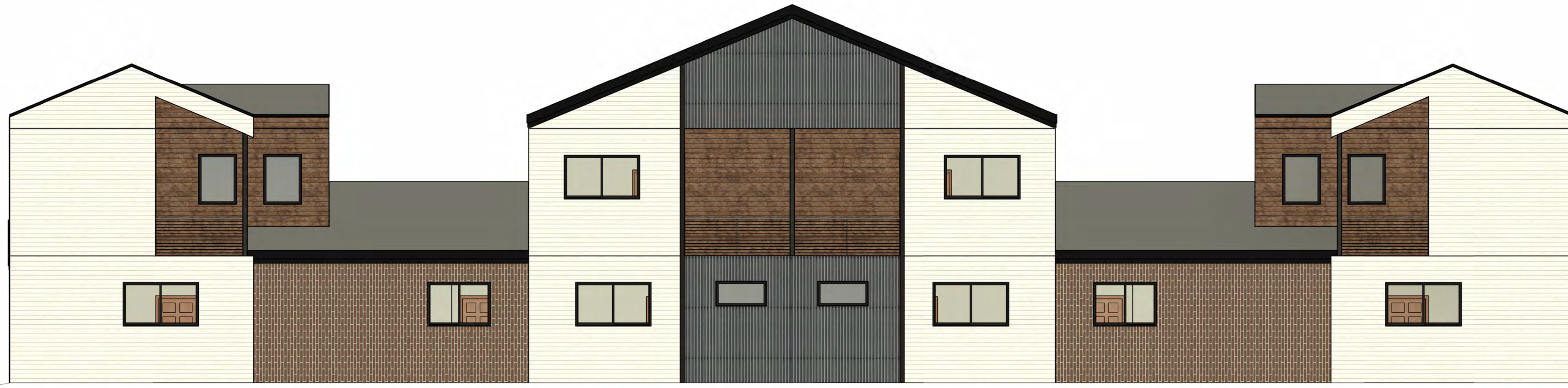
1 NORTH ELEVATION A4.1 3/16" = 1'-0" (RE: 17.A0.1)