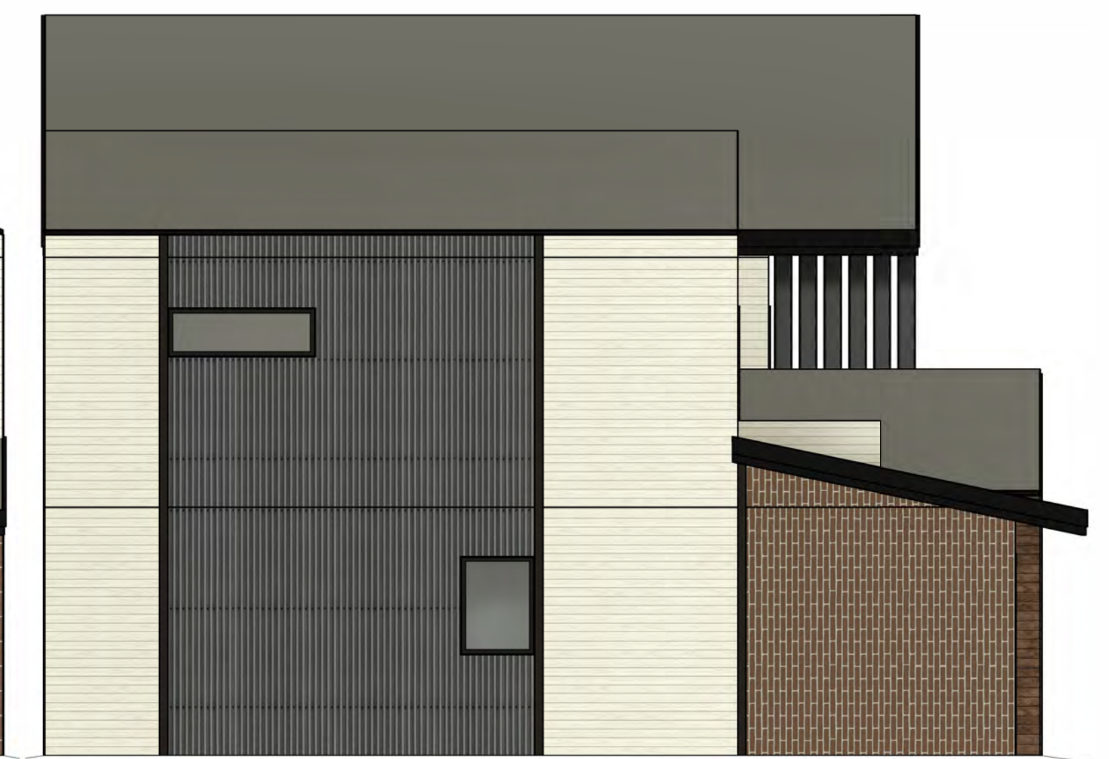
4 WEST ELEVATION A4.1 3/16" = 1'-0" (RE: 17.A0.1)