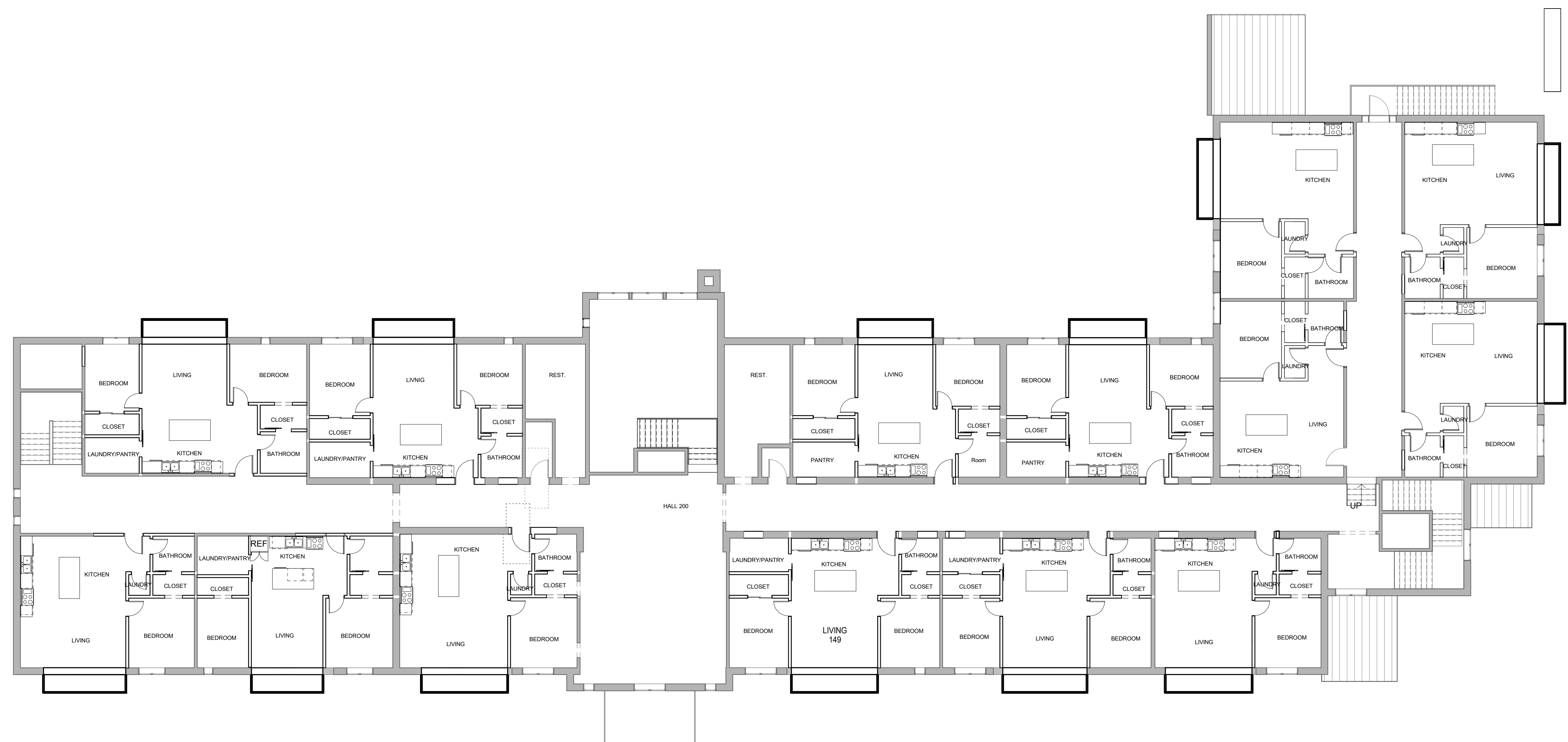
1 SECOND FLOOR A1.04 3/32" = 1'-0"